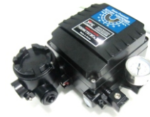
OPTIONAL Electro Positioner 4-20mA